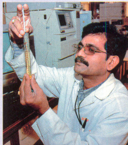
Dr Reddy's Labs: Financial investors share the risks