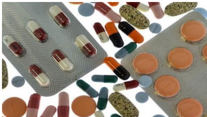
"Molflu is expected to be available from early next week in pharmacies throughout the country with particular focus on states with high caseload of COVID-19," the spokesperson noted.

Dr Reddy's Laboratories on Tuesday said it will launch Molflu (Molnupiravir) at Rs 35 per capsule to treat COVID-19 in the country. Molflu will be priced at Rs 35 per capsule, a spokesperson of the Hyderabad-based drug maker said in a statement. With 10 capsules per strip, the total course of 40 capsules over 5 days would cost Rs 1,400, making it among the most affordable treatment options available to patients, it added.