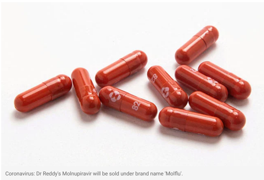
Coronavirus: Dr Reddy's Molnupiravir will be sold under brand name 'Molflu'.