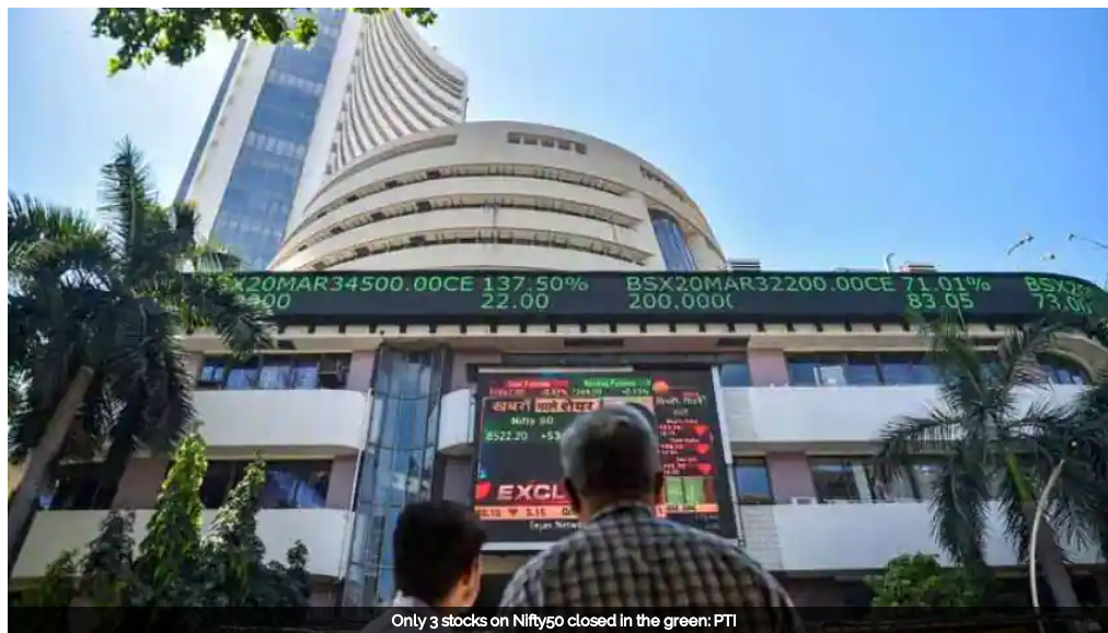
Only 3 stocks on Nifty50 closed in the green: PTI