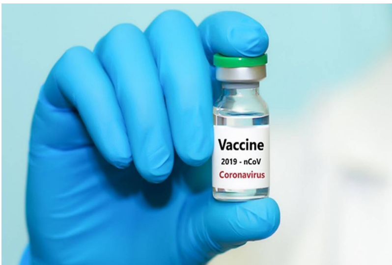
The common side-effects of these vaccines include tenderness, pain, warmth, redness, itching, swelling or bruising where the injection is given.