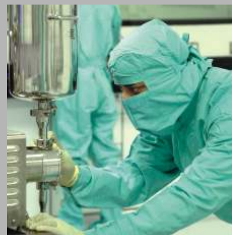
A scientist deeply engaged at the Discovery Research Center. Discovery Research focuses on early phase discovery of newly synthesized compounds for the treatment of diseases, such as metabolic disorders, anti-infectives and inflammation.

Promius Pharma™, our wholly owned subsidiary, headquartered in New Jersey, US, develops and markets differentiated formulations for important dermatology indications. Our portfolio includes in-licensed and co-developed dermatological products and an internal pipeline of products under development that will provide better answers to the skin care needs of today and tomorrow. The launch of EpiCeram® Skin Barrier Emulsion used in the treatment of atopic dermatitis and Scytera™ for the treatment of chronic psoriasis marks the entry of our branded dermatology products into the US market. A well identified product portfolio and a highly committed team of field representatives promise differentiated and responsive service to healthcare professionals, patients, and the larger dermatology community in the US.